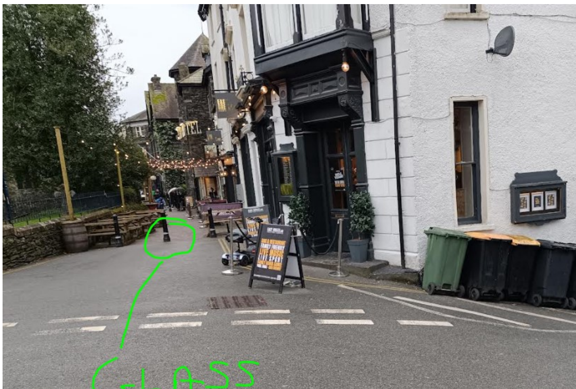
Pavements are blocked with Lago A boards and other A boards.

Already in other areas that have outside licensed areas Glass was all over the pavement outside the Easy Breeze just last Sat 16th March 2024 which i had to carry a dog over this broken glass.